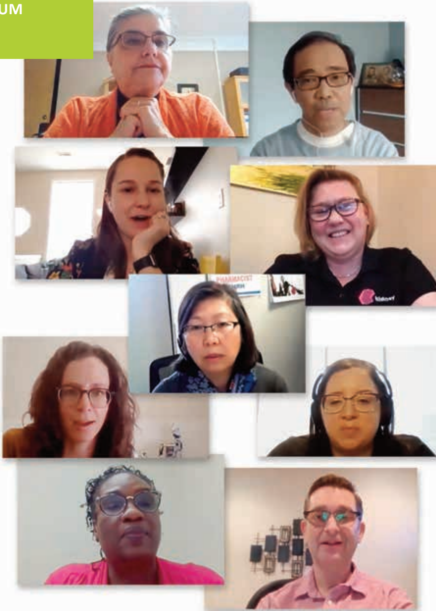
A number of renal and allied health care professionals and those with lived experience gave their time to help us deliver an engaging virtual educational forum.

Even before the world was forced to pivot to doing things, The Kidney Foundation of Canada embraced the virtual landscape with its series of interactive webinars. Since then, digital meetings and conferences have become the norm, and the Foundation continues to spearhead new modalities of engaging with people living with kidney disease and caregivers.